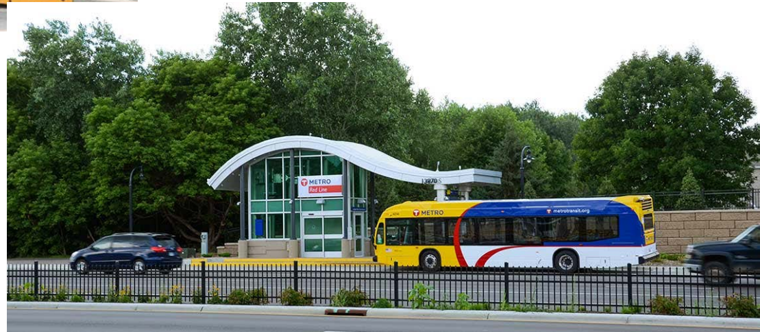
Red Line, Apple Valley, Minnesota