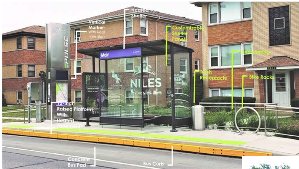
Pace Pulse Rapid Transit Service, Chicago Area