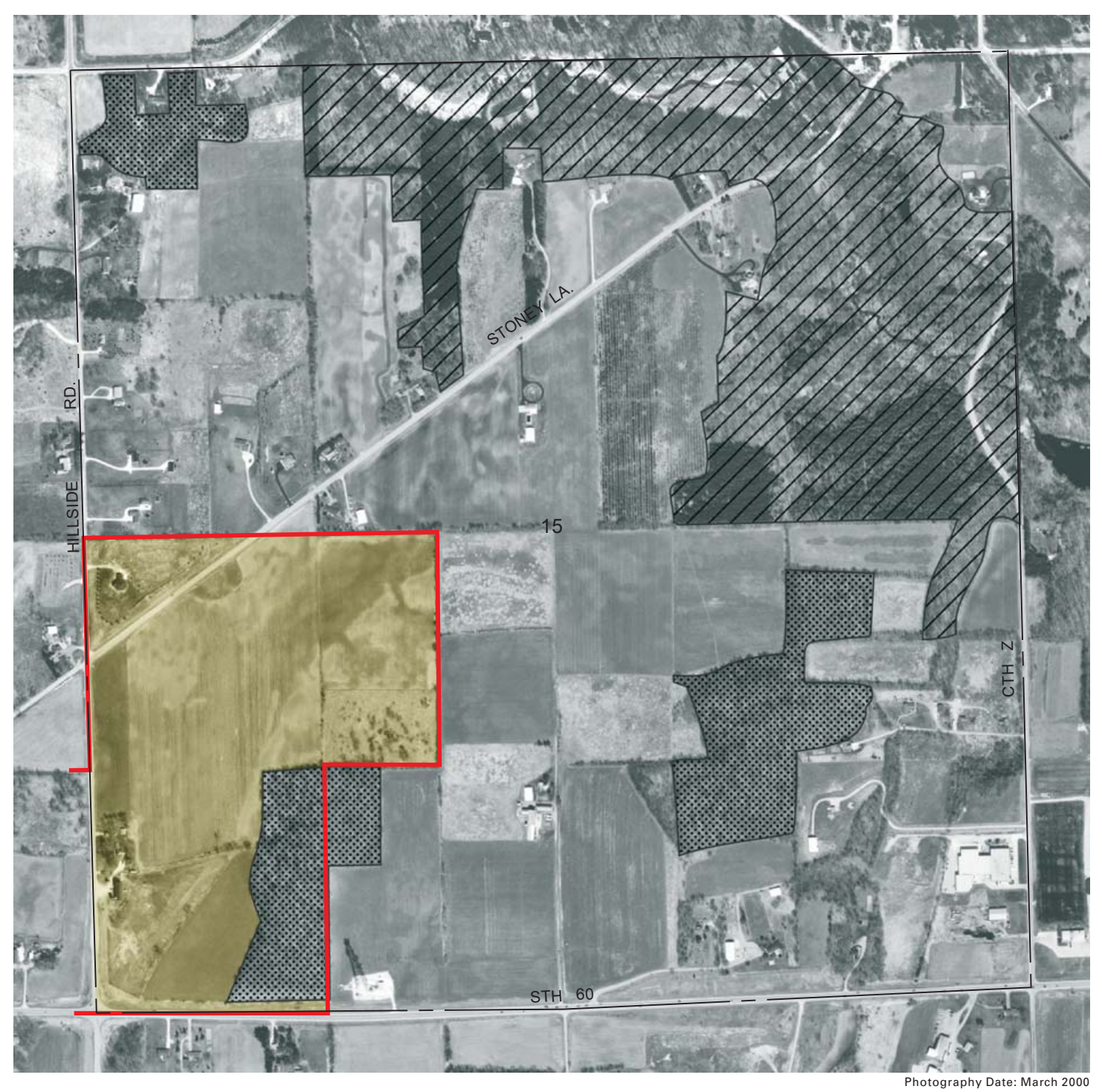
U. S. Public Land Survey Section 15 Township 10 North, Range 19 East