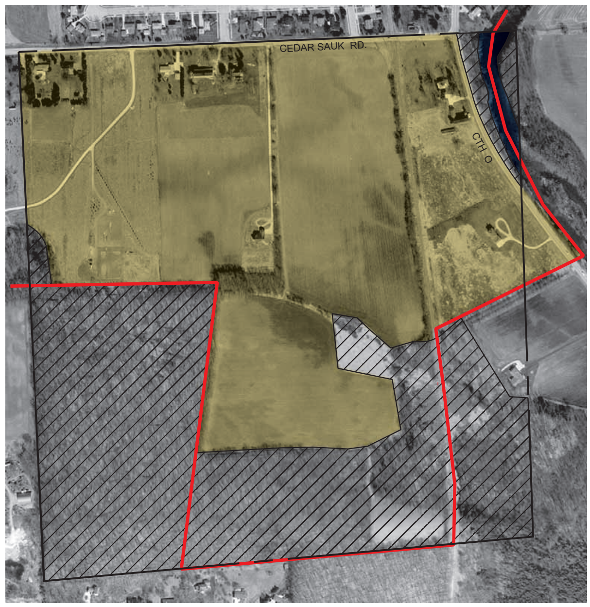
Photography Date: 2000

Northeast Quarter of U. S. Public Land Survey Section 1 Township 10 North, Range 21 East