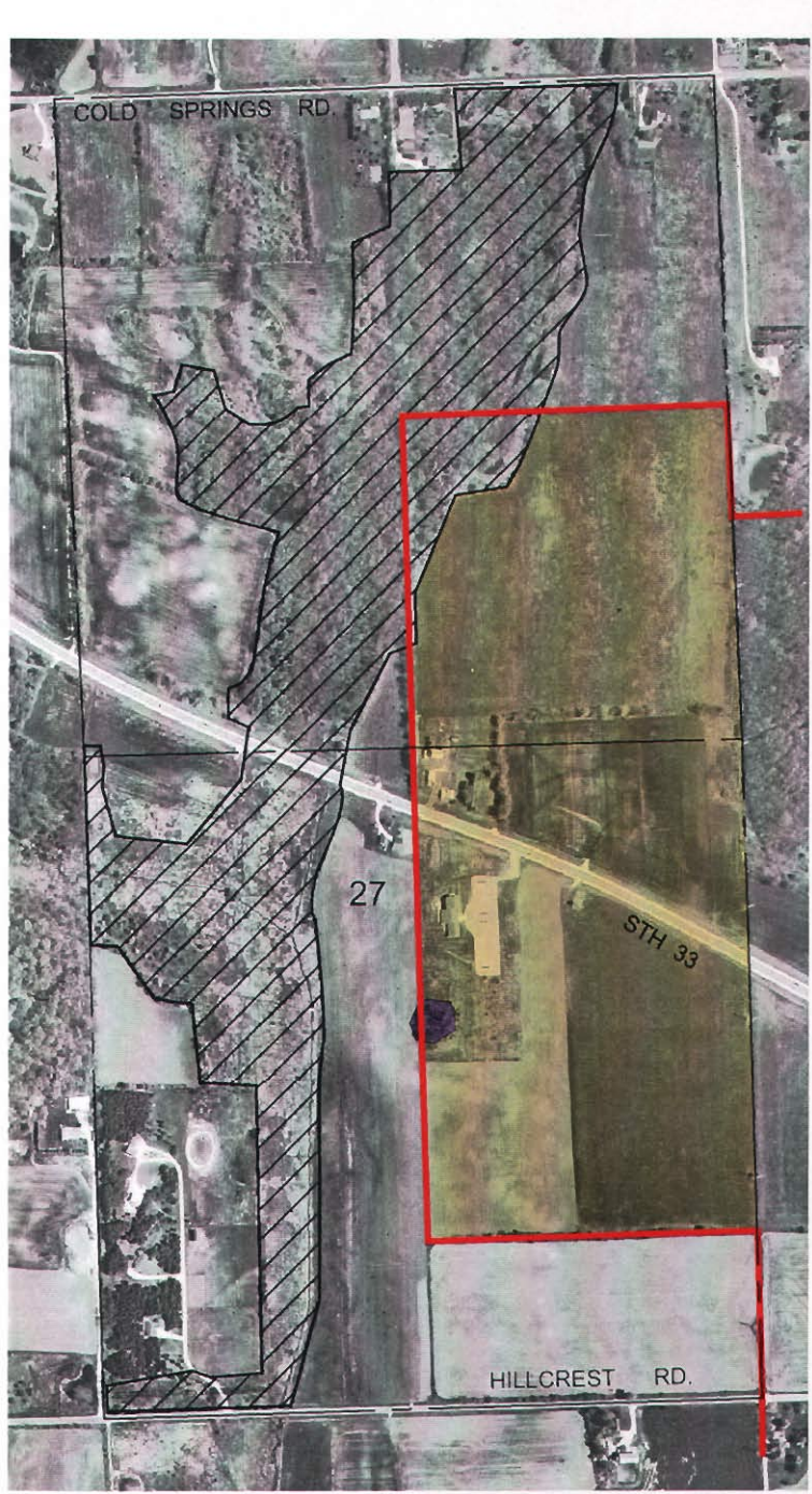
Photography Date: 1995