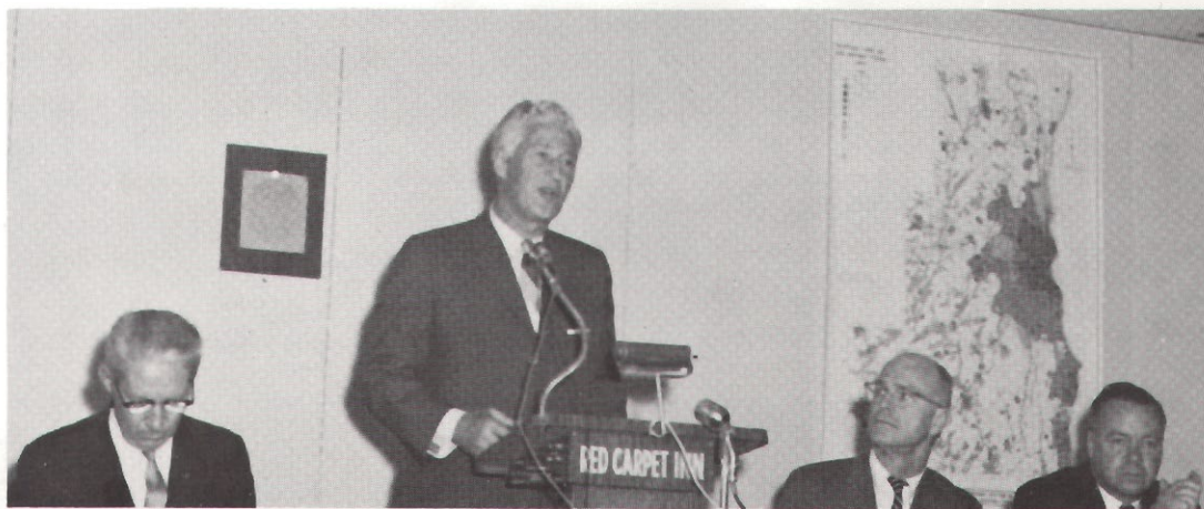
Governor Warren P. Knowles

Governor Knowles spoke on "The Need for Regional Planning." In referring to a personal inspection he had made of the Southeastern Wisconsin Regional Planning Commission offices, the Governor said that he had been deeply impressed by the breadth, as well as the depth and thoroughness, of the work being performed. Governor Knowles emphasized that the collection and analysis of the millions of pieces of information necessary to prepare a comprehensive plan could only have been accomplished through the cooperative efforts of the 153 local units of government within the Region