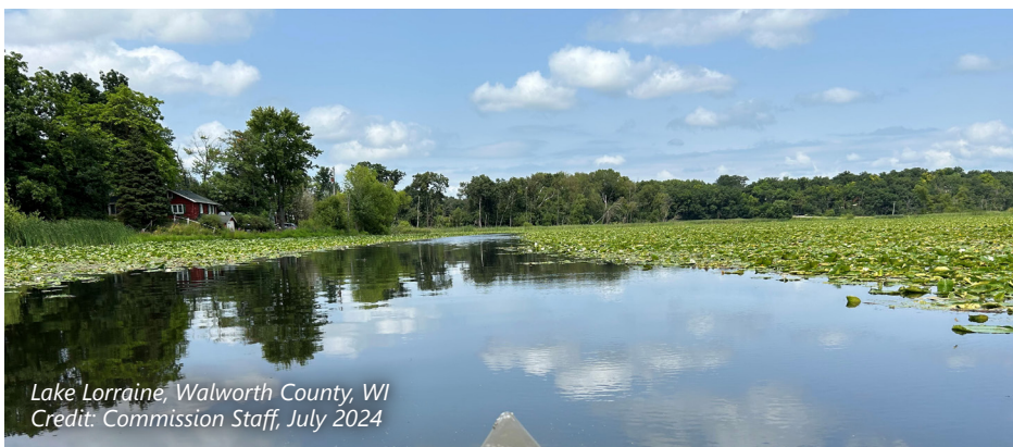
Lake Lorraine, Walworth County, WI Credit: Commission Staff, July 2024

Staff plan to conduct aquatic plant surveys, water quality monitoring, aquatic invasive species surveys and shoreline surveys on the lakes. Five lakes will be surveyed in 2025 with the remaining lakes surveyed in summer 2026. This survey data and reporting will help establish the ecological status of these waterbodies to assist in management strategies to protect and restore them, so that they continue to serve the Milwaukee County communities for years to come. Look for summary reports near the end of 2025!