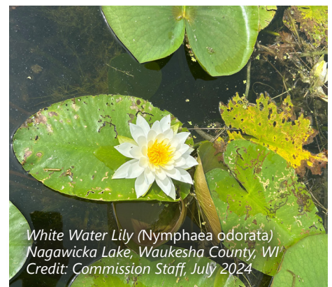
White Water Lily ( Nymphaea odorata ) Nagawicka Lake, Waukesha County, WI Credit: Commission Staff, July 2024