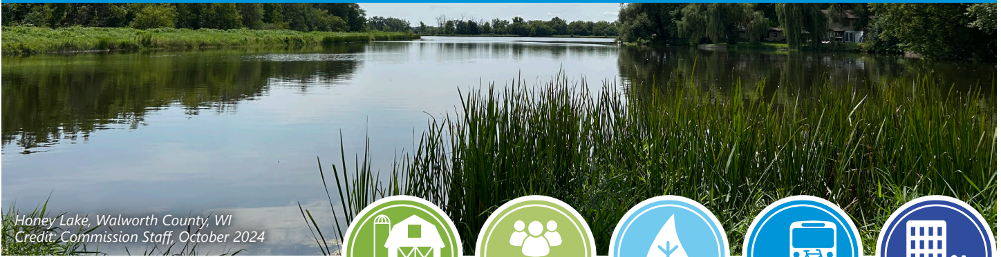
Honey Lake, Walworth County, WI

A publication of the Southeastern Wisconsin Regional Planning Commission