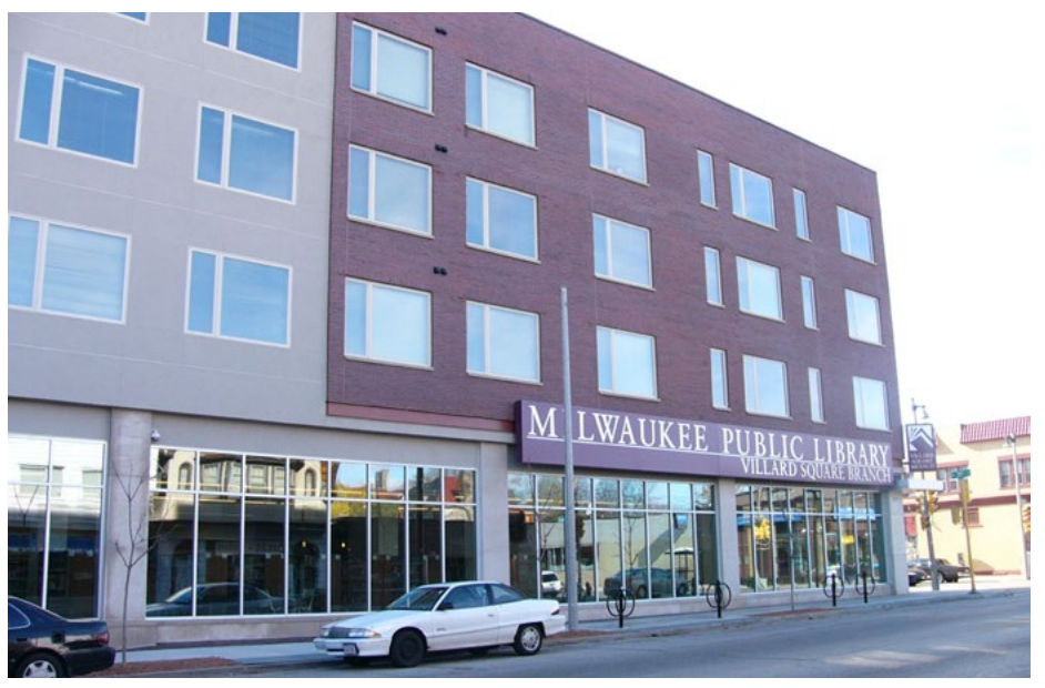
Library Located on the Groundfloor of an Apartment Building