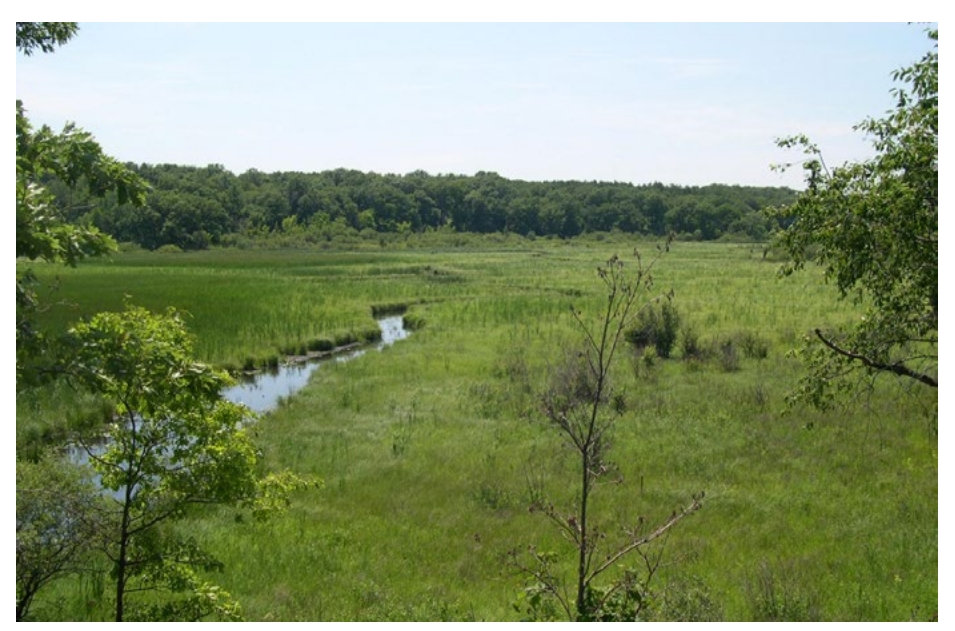
Primary Environmental Corridor Along a Stream