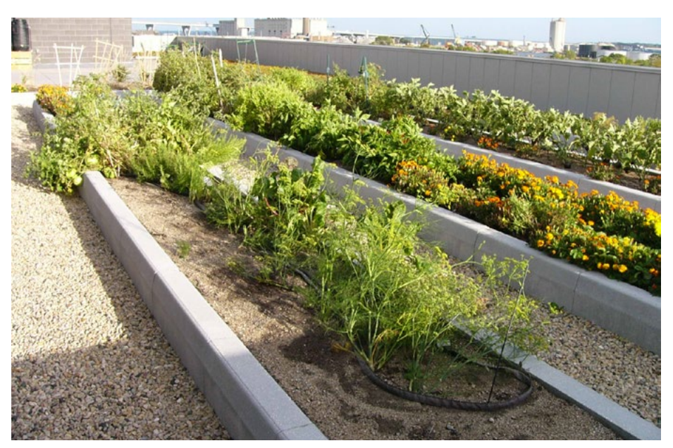
Rooftop Garden