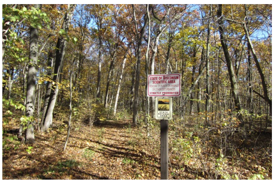
Natural Area Including Southern Dry-Mesic Forest