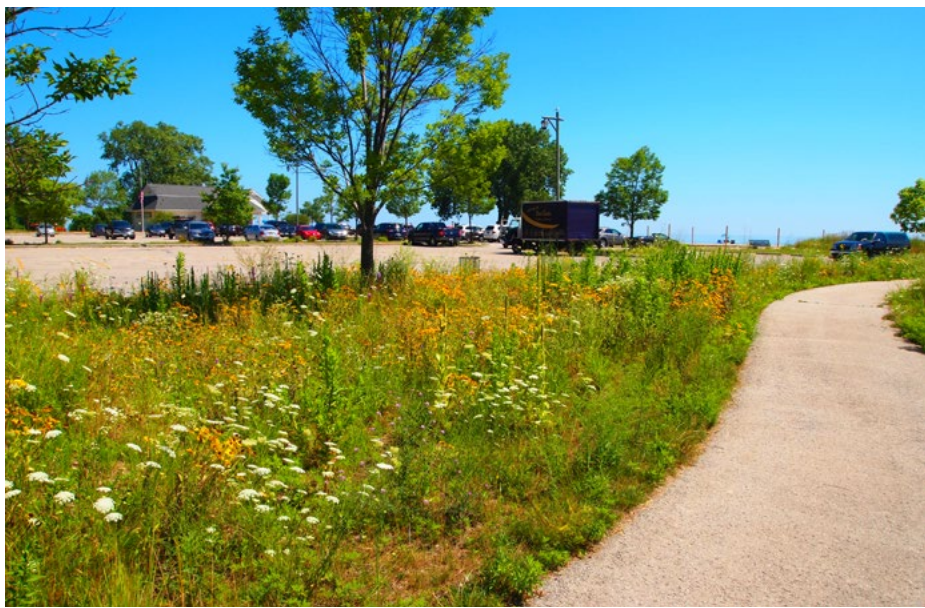
Bioswale Promoting Native Plant Species that Requires Management to Protect Against Invasive Species