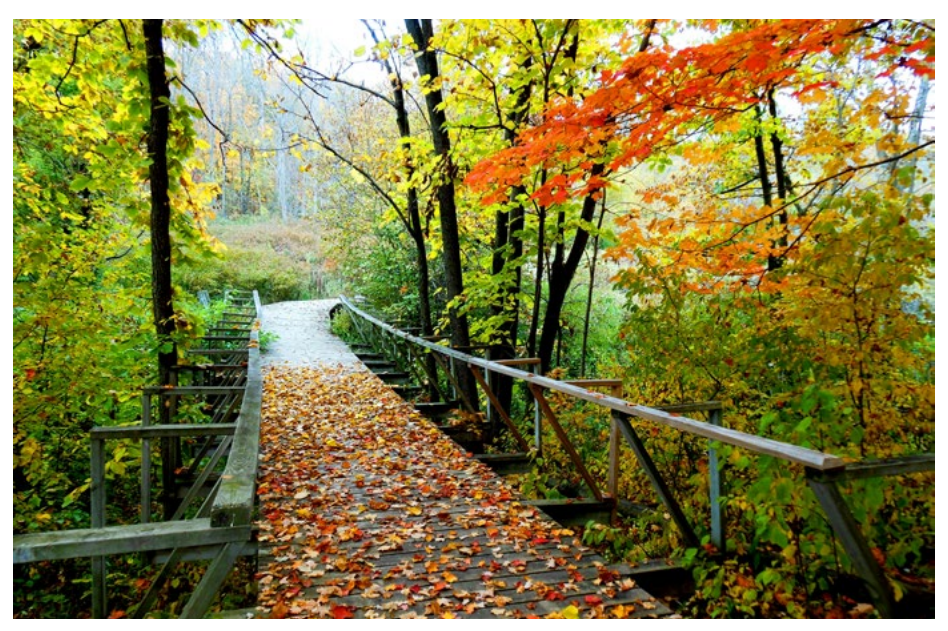
Recreational Trail, an Example of a Resource-Oriented Outdoor Facility

o Provide major park and recreation sites with a minimum gross site area of 250 acres and opportunities for a variety of resourceoriented outdoor recreational activities within a 10-mile service radius of every dwelling unit in the Region.