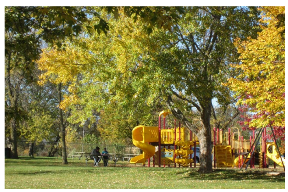
Playground in a Community Park