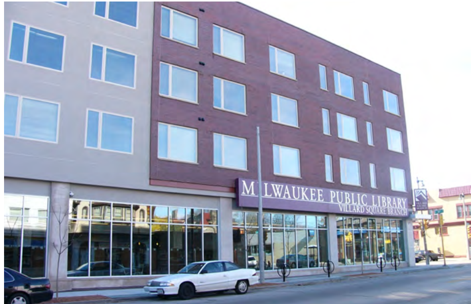
Library Located on the Groundfloor of an Apartment Building