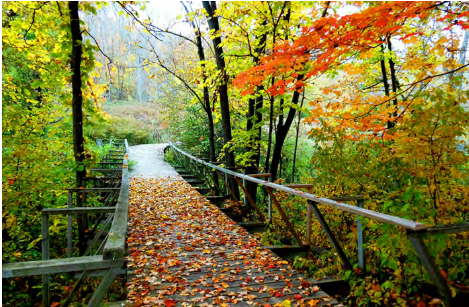
Recreational Trail, an Example of a Resource-Oriented Outdoor Facility