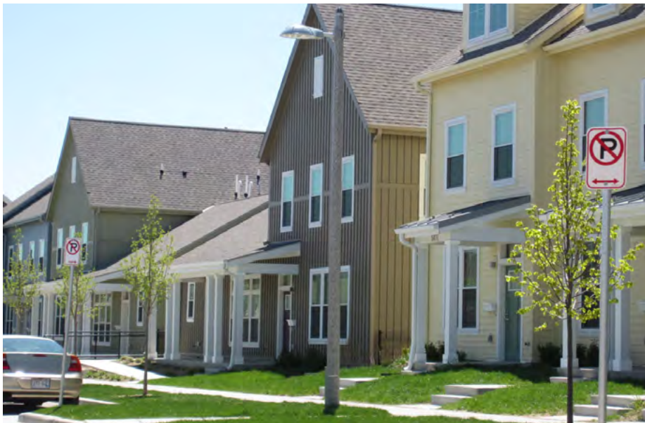
Traditional Neighborhood Development