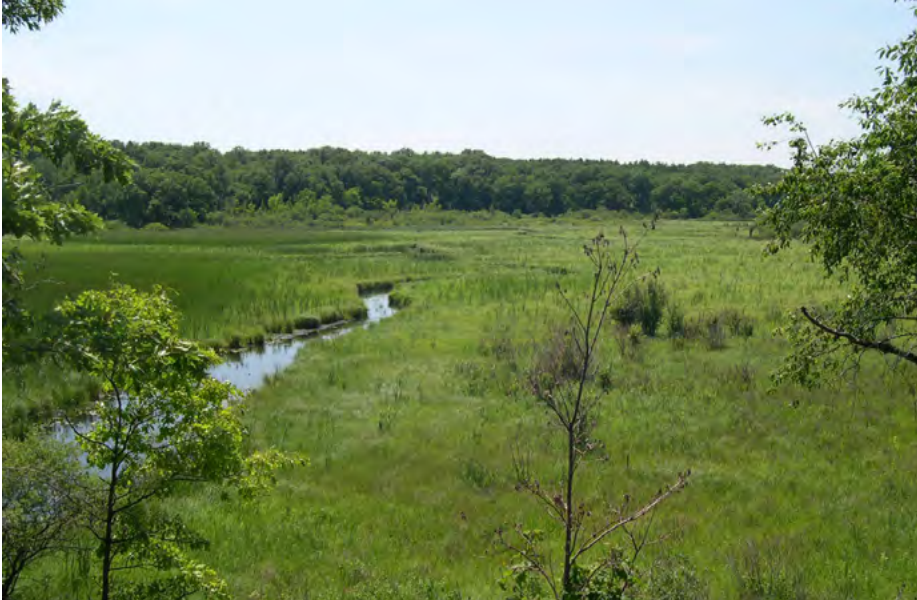
Primary Environmental Corridor Along a Stream