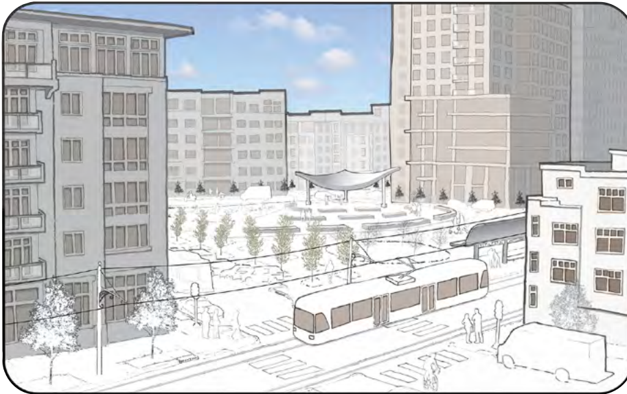
Public Plaza Near a Rapid Transit Station