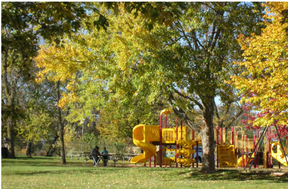
Playground in a Community Park