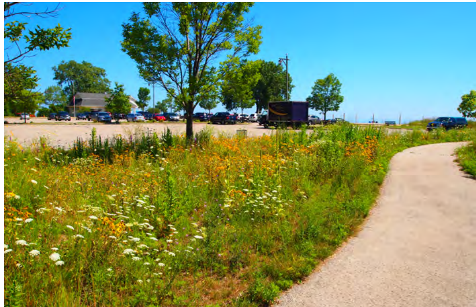
Bioswale Promoting Native Plant Species that Requires Management to Protect Against Invasive Species