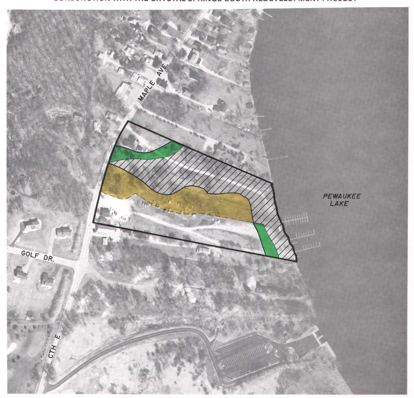
CRYSTAL SPRINGS SOUTH REDEVELOPMENT PROJECT TOWN OF DELAFIELD PART OF SE I/4 SECTION I5, T. 7 N., R. I8 E.