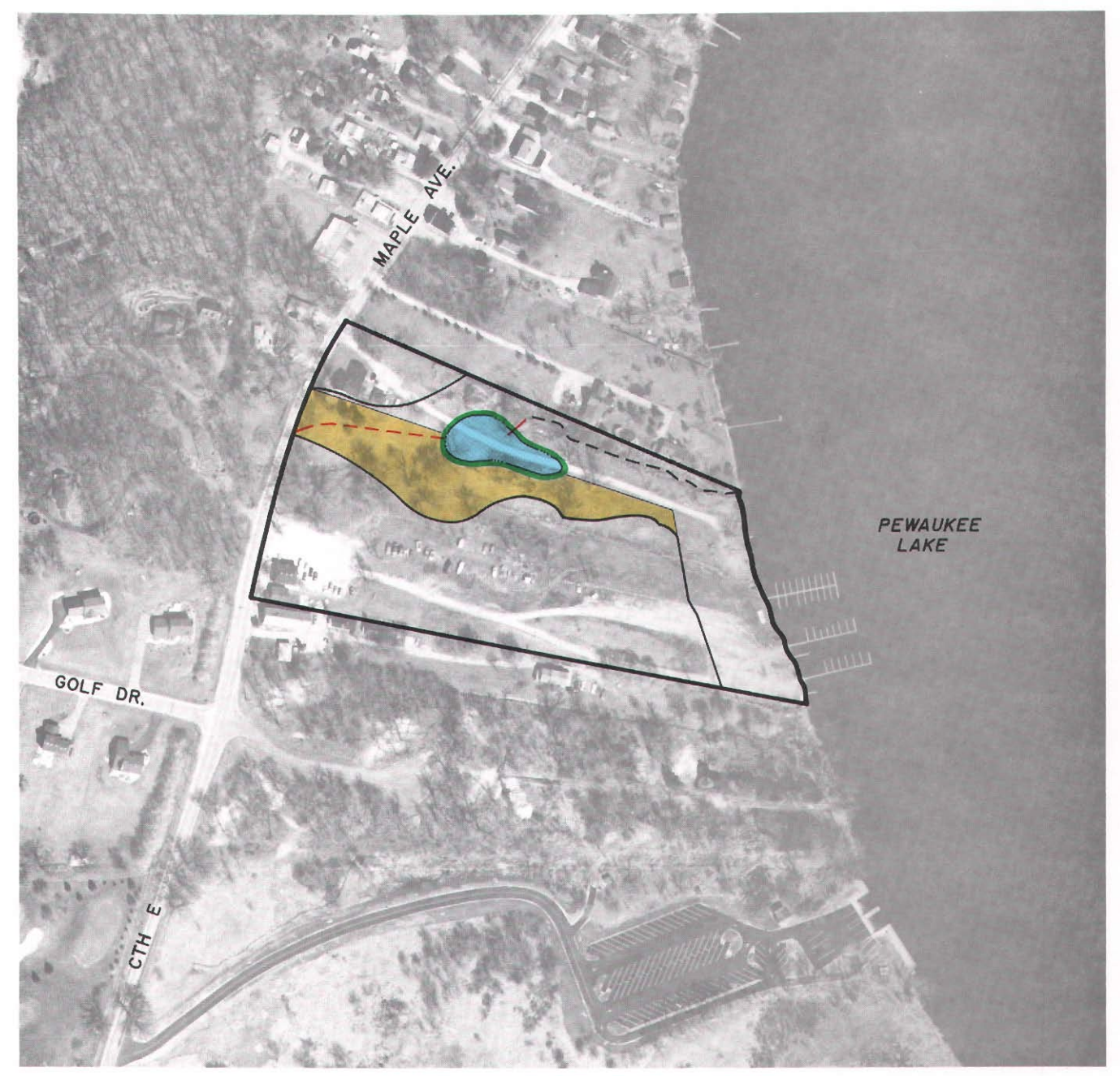
CRYSTAL SPRINGS SOUTH REDEVELOPMENT PROJECT TOWN OF DELAFIELD PART OF SE I/4 SECTION I5, T. 7 N., R. I8 E.