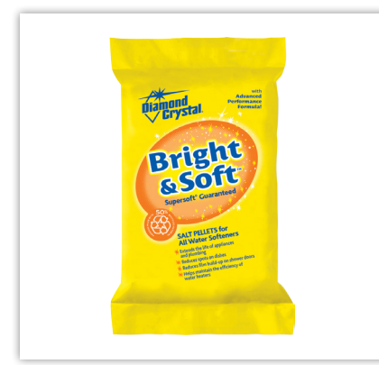
Discharges from water softeners to wastewater treatment plants or septic systems are sources of chloride to surface water and groundwater.

For more information on the Chloride Impact Study go to www.sewrpc.org/chloridestudy