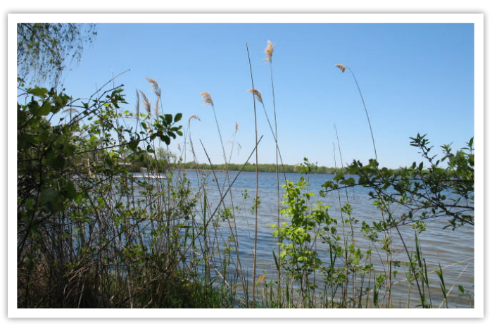
Wind Lake in Racine County is one of the Region's lakes where increasing chloride concentrations have been measured.

Large-Scale Topographic Maps, Cadastral Maps, Ratioed and Rectified Aerial Photographs, and Orthophotographs Large-scale topographic maps, cadastral maps, ratioed and rectified aerial photographs, and orthophotographs prepared to Commission standards and obtained by the Commission and the counties and municipalities of the Region provide more detailed information than that provided by the general base maps. Those large-scale maps, which have been prepared periodically since the Commission was established in 1960, will be used to obtain information on such natural features as relief, location of watershed and subwatershed boundaries, location of streams and water courses, lakes, reservoirs, and wetlands; upon such manmade features as civil