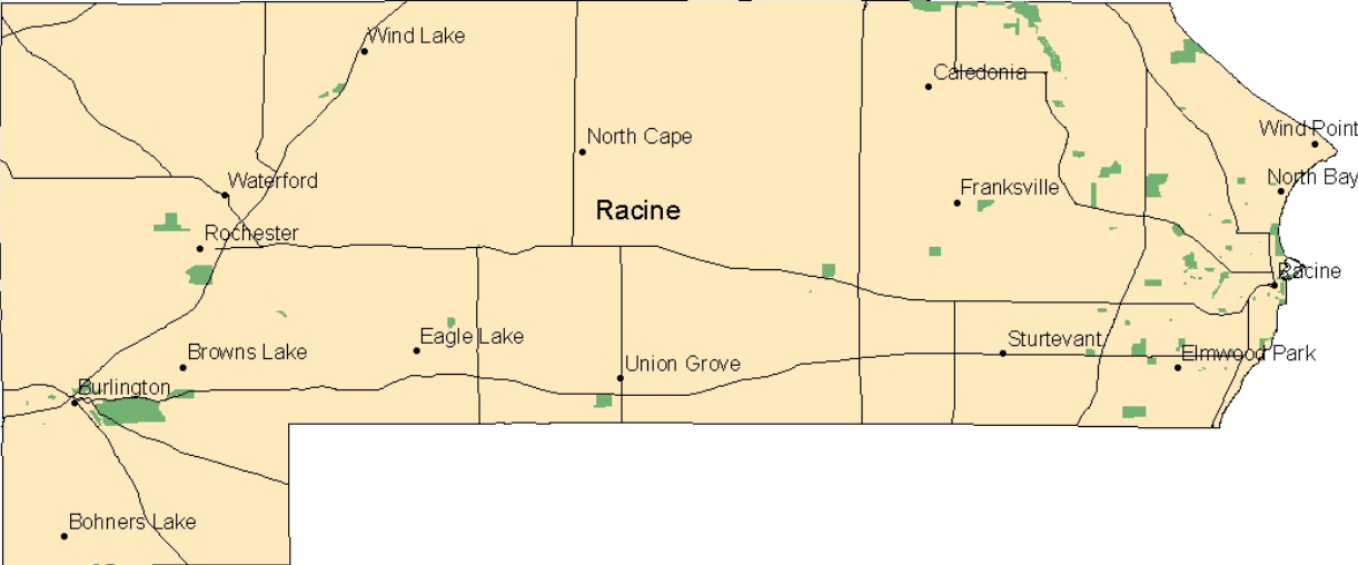
Figure 1. Racine County, Wisconsin

The comprehensive nature of the NAHB model requires a local area large enough to include the labor and housing market in which the homes are built. The local benefits captured by the model, including revenue generated for local governments, include the ripple impacts of spending and taxes paid by construction workers and new residents, which occur in an economic market area. For a valid comparison, costs should be calculated for the same area.